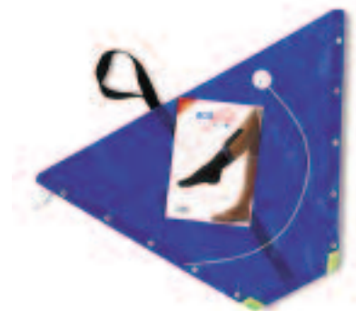
ActiGlide® Hosiery Applicator (PIP Code: 284-5196)

Call our customer care line: 08450 606 707 International enquiries: +44 1283 576 800 or visit our website at: www.Lohmann-Rauscher.co.uk